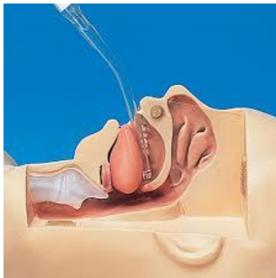
Diagram showing Oro-pharyngeal Suctioning, using a Yankauer Suction Catheter